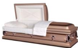
Payne Copper (Victoriaville MR260-00056) 20 gauge steel with tan crepe interior. Casket is not suitable for cremation. $3,325