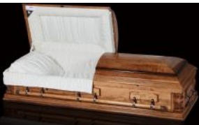
Carolina (Northern 645) Poplar with rosetan crepe interior. $3,860