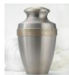
Milano Floral Victoriaville Bronze US210-00012 $545.00