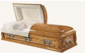
Digby (Victoriaville WR232-00429) Ash with beige crepe interior. $3,690