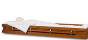
Starmark Rental Container (Northern 707) Select Wood with beige crepe interior. Price includes cremation container insert. $775