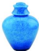
Phenicia Aqua Victoriaville Glass US710-00003 $695.00