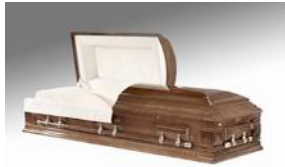
Briar Hill (Victoriaville WR227-20001) Bird's Eye Maple with champagne linen interior. $4,690

All Caskets listed are standard adult size and are suitable for cremation unless otherwise indicated. Oversize and youth caskets are available upon request.