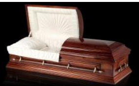
Homestead (Northern 707) Maple with tan crepe interior. $3,875