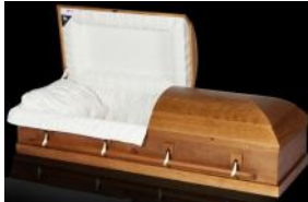
Morden (Northern 446) Poplar with rosetan crepe interior. $2,995