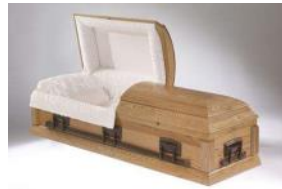
Brunswick (Victoriaville WR232-00435) Ash with beige crepe interior. $2,995