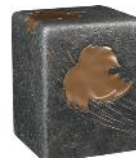
Autumn Bronze Victoriaville Polystone US899-20007 $400.00