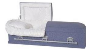
Winston (Victoriaville DR220-00044) Cloth covered with white silk interior. $1,875