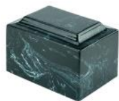
Evergreen Victoriaville Marble US335-20003 $490.00