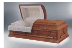
Northgate Rental Casket (Victoriaville WL210-00015) Oak with tan crepe interior. Price includes cremation container insert. $2,475