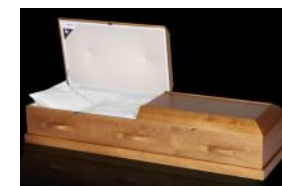
Apella (Northern 250) Poplar veneer with white taffeta interior. $995