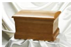
Artisan Victoriaville Poplar US150-00276 $465.00