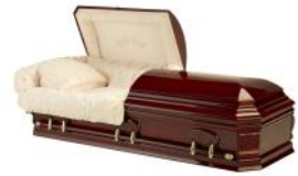
Rose Arbor (Northern 500M) Poplar with pink crepe interior. $3,890