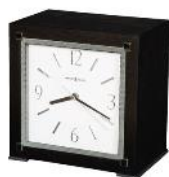
Sophisticate Clock North Urn Wood 800-198 $445.00