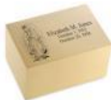
Bronze Chest Victoriaville US210-00020 $775.00