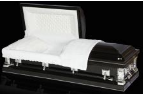
Dayton Black (Northern N207) 18 gauge steel with silver crepe. Casket is not suitable for cremation. $3,980