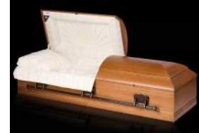
Carter (Northern 228LW) Poplar with rosetan crepe interior. $2,775