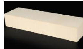
Basic Container (Northern 10) Simple particle board with no interior lining. $490