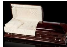
Minto (Northern 632) Poplar with rosetan crepe interior. $2,925